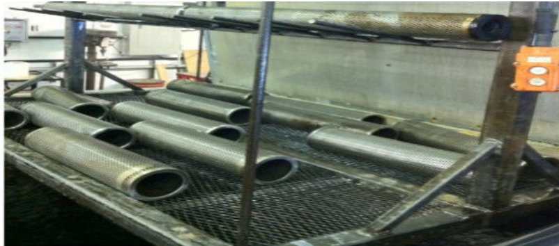
Oil Filters for cleaning