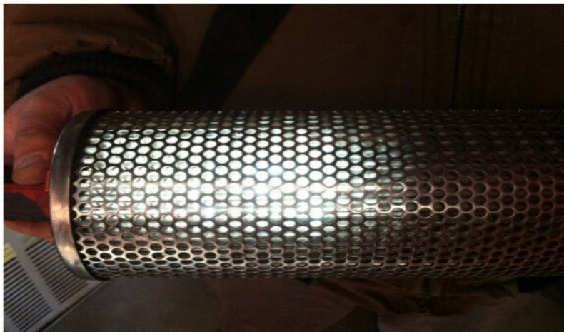
Cleaned oil filters with Light passing through