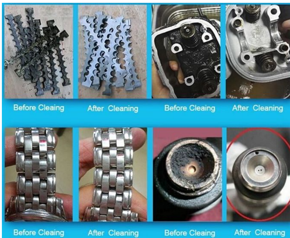
Same models with different capacity