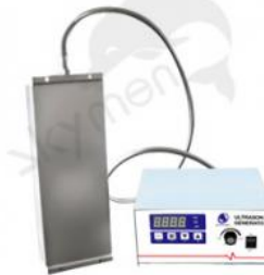
Outlet mode-hose diagram