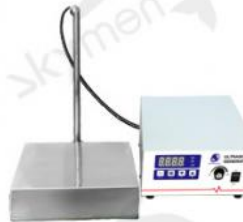
Outlet method-hard tube diagram