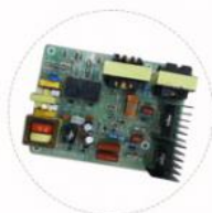
upgrade driver board