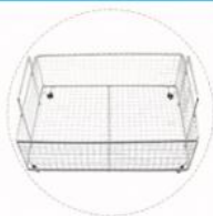
sus basket (optional)