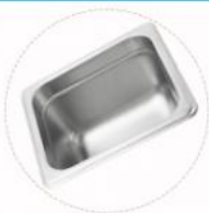
tank size :500 x300x200